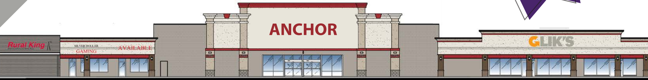
1 R Elevation A (East) NTS.