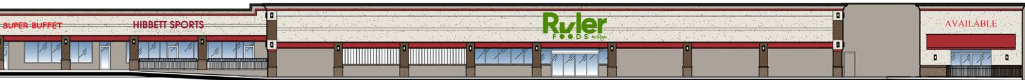
2 R Elevation B (North) NTS.